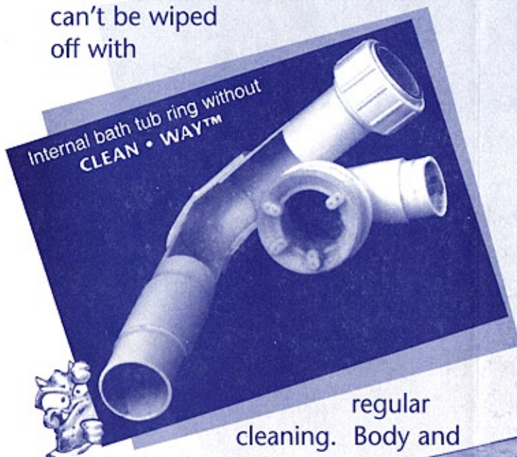
Internal bath tub ring without CLEAN • WAY™

Most whirlpool bath tubs, hot tubs and spas have over 24 feet of complex pipes and fittings that gather an "internal bath tub ring" that just can't be wiped off with