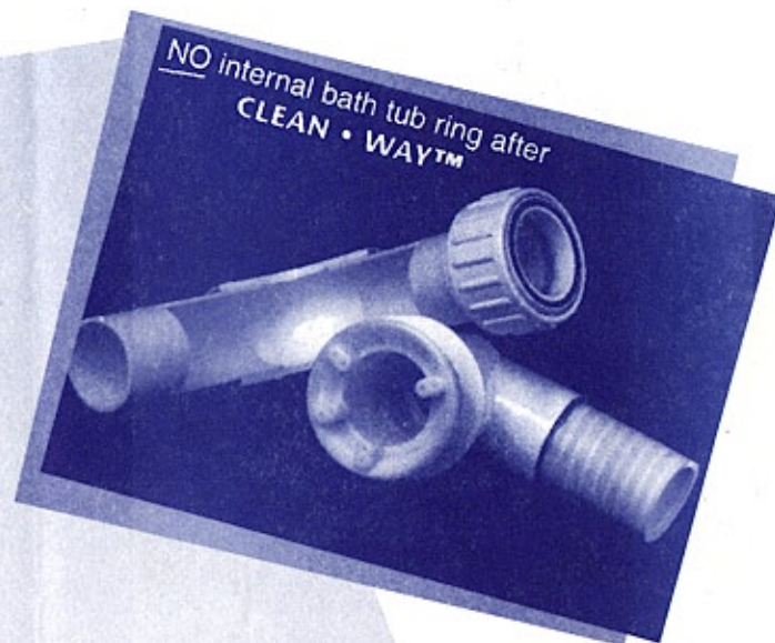
NO internal bath tub ring after CLEAN • WAY™

As the gathering of this scum accumulates it also retains moisture which can contribute to bacteria and mold growth. CLEAN • WAY™ is specially formulated with a natural citrus solvent that dissolves this built up scum. With regular use you can keep the inside of the pipes and pump as clean as your tub itself with a fresh clean citrus scent.